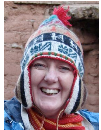
President Liz Wynn in Peru

The pricing strategy for many years has been to increase the nightly rates by 2-3% per annum to reflect the average CPI rates. One of the exceptions being in 2000 when rates increased by 10% due to the introduction of the GST.