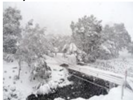
August 2nd