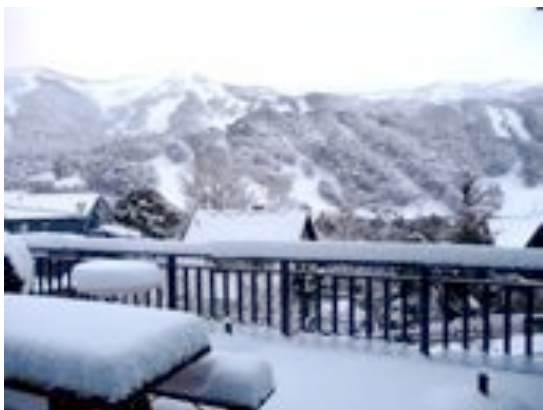
August 2nd