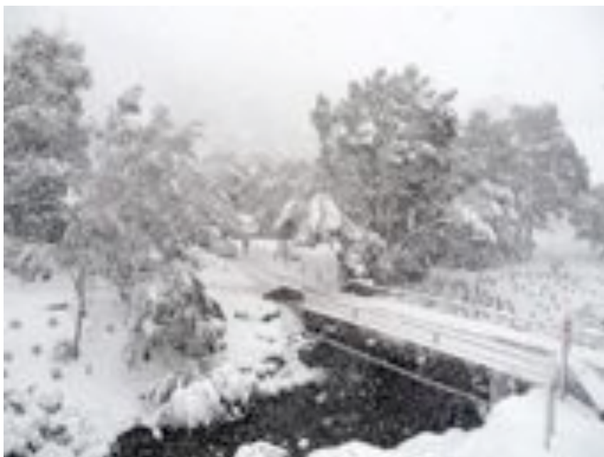
August 2nd