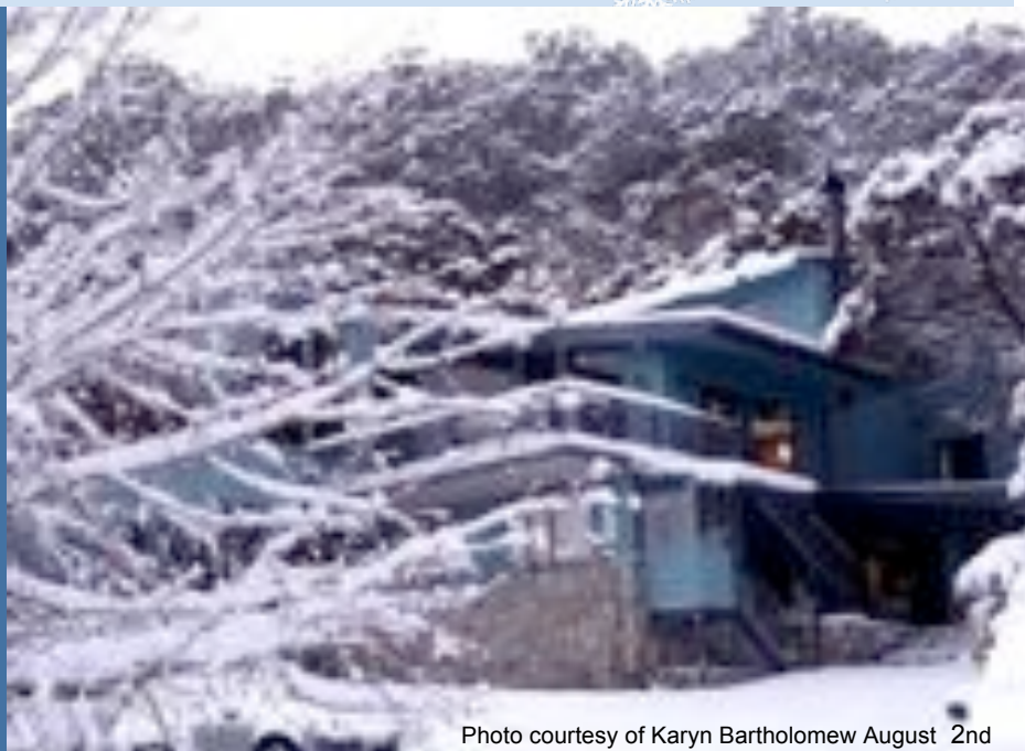
August 2nd