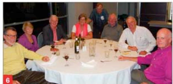
14 Kiama Independent, Wednesday, May 12, 2010