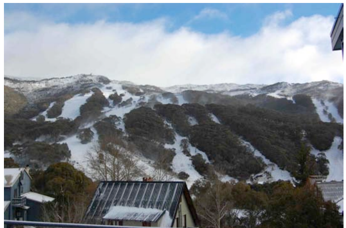
Thredbo - June 2010